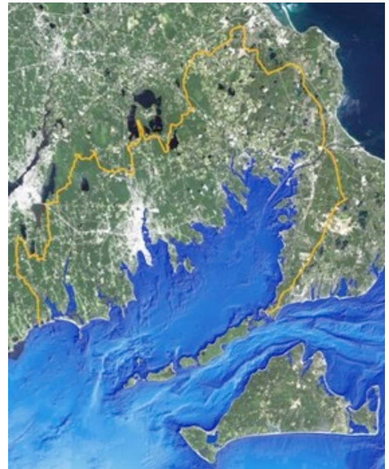
Topographical map of Buzzards Bay, showing the bay's 432-square-mile watershed, twice the size of the bay itself (from the Buzzards Bay Coalition website).

Quissett Harbor, however, is showing signs of nutrient-related decline. Nitrogen inputs must be reduced to fully restore the harbor. MEP estimates that there needs to be a 22% reduction in the locally control-