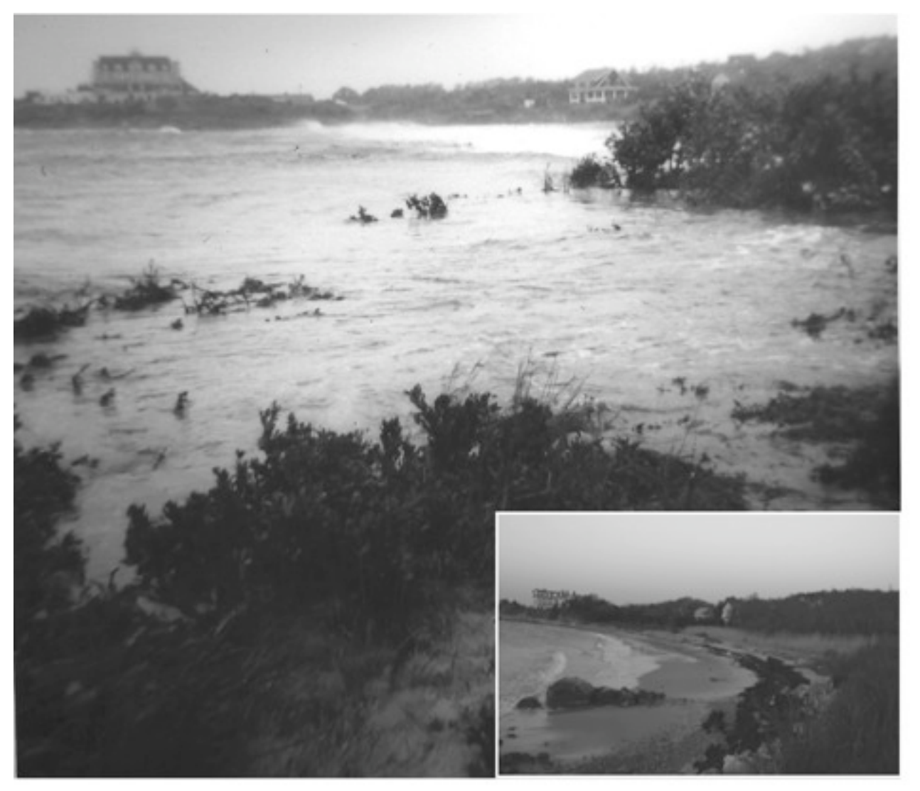
A 17-foot storm tide surging over Gunning Point Beach and Pond during Hurricane Carol in 1954. The inset shows the beach from approximately the same location where Janice took her photo.